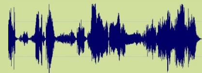
Fig. 1 – Waveform.

In addition, we use these methods to develop software applications, which include tools and educational games for the blind, and tools for multimedia indexing.