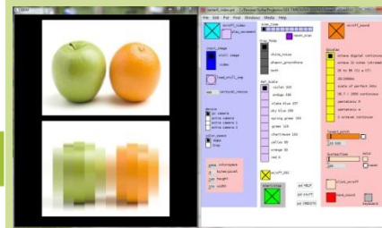
Fig. 2 – SonarX – from color to sound.

We use audio signal processing techniques, data-driven methods and multivariate decomposition techniques to learn the intrinsic structures that characterize the sounds (Fig. 3).