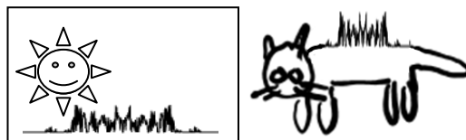
Figure 2: Possible characters of the Sound Game

Besides the already mentioned characters, there is also other type of characters, the evolutionary characters, similar to the Tamagotchi (Bandai 2010), which change through time. The game has two types of evolutionary characters, an egg and a seed. The quieter the children are, the faster the egg will hatch, revealing a newborn creature, and the faster the seed will grow into a flower. This evolution takes several hours of game play. So, if the teacher wants to use this game during several classes it is possible to choose these long term characters. If the teacher only wants to use the game during a single class, then the non evolutionary characters are more appropriate.