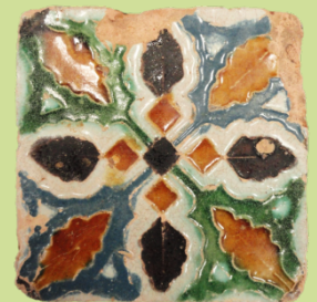
Hispano-Moresque tile from Mosteiro de Santa Clara-a-Velha