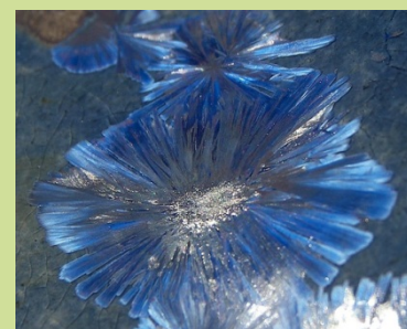
Example of a crystalline glaze