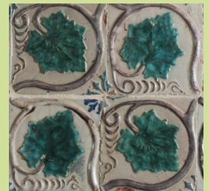
Hispano-Moresque panel in Sintra National Palace